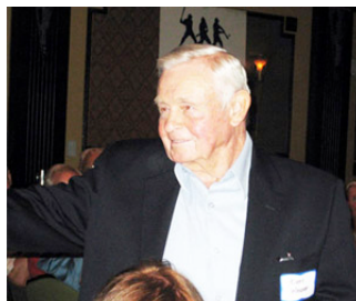
Earl Weaver Baseball Hall of Fame